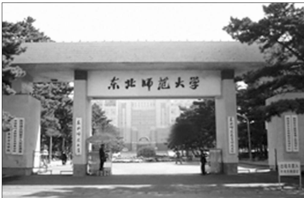
The main gate at Northeast Normal University.