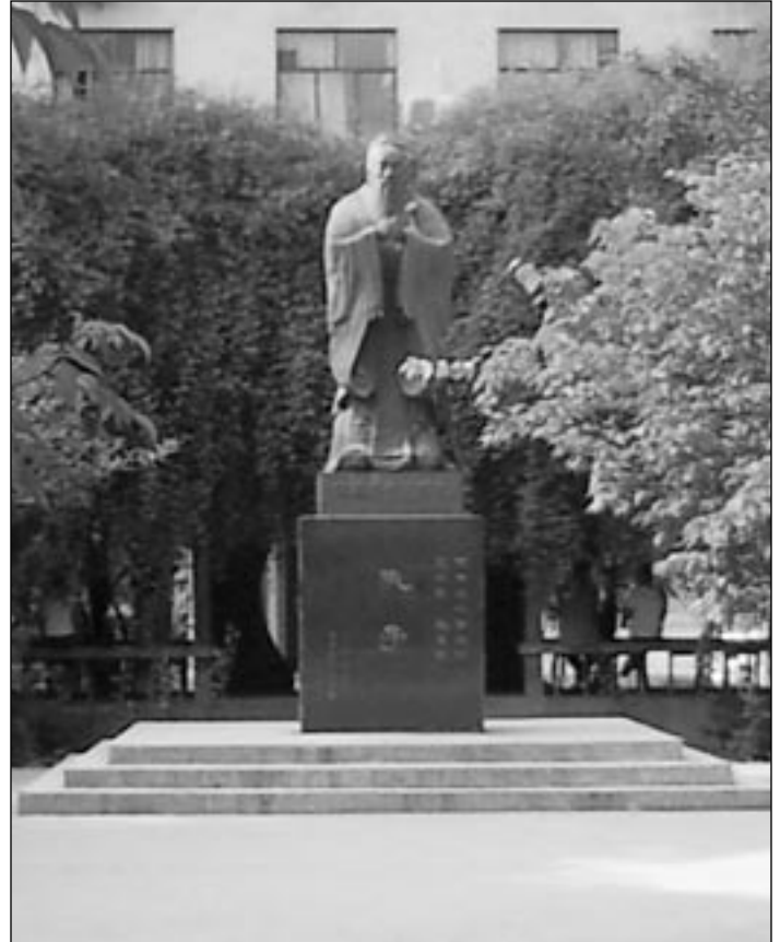
Statue of Confucius, found often on campuses in China. This one is at Northeast Normal University in Xian.

Though she keeps the house, slaves for the whole family, and loves them, her own living conditions do not fit her position as grandmother, nor honor her contribution to the family. Her room is not a room at all, but a passage-way from kitchen to dining room, cluttered with the sewing-machine, the children's rocking-horse, and the clothing they throw off as they rush by. Her bed is hard, without springs and with only a thin cotton mattress. Her nightgowns are patched and sewn. In addition, her things are almost required to be invisible in the house. Her calico dresses and the tobacco box holding her soap are kept behind a cloth curtain in one corner, and her comb is kept in her pocket. She obediently follows "an understood rule that she was not to receive visitors alone" (268), because she never wants to arouse Victoria, her daughter's,