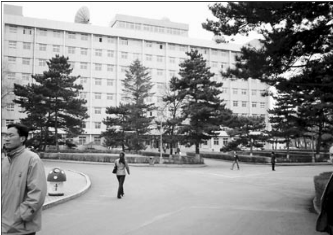
The Foreign Language College at Northeast Normal University.

Or the focus on alienation may have stemmed from the ironic fact that this in some ways most rooted of writers had, in another sense, no real roots. That is, what roots she had were actually her memories. She lived a somewhat transient life—born in